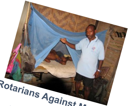
Rotarians Against Malaria